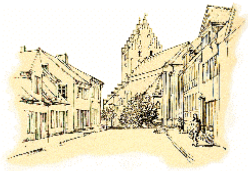
Sct. Peders Church seen from Købmagergade

A walk of about an hour will give you a good impression of Naestved. It would be a good idea to start your walk at Sct. Peder's Square. Here you find yourself right in the heart of medieval Naestved. This was when the city was pinned between the 10 kilometre long Mogenstrup Ås (a ridge ) and the Suså (a stream).